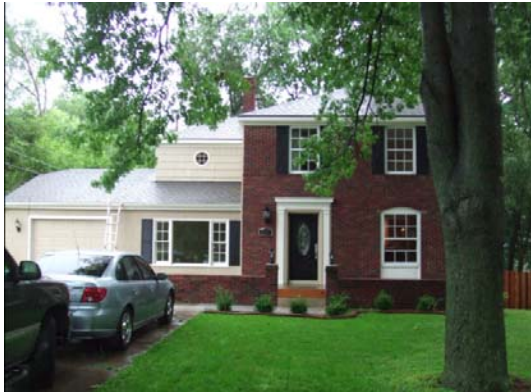
New Rectory for St. James