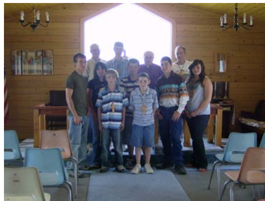
Campers attend the Holy Eucharist in the Church of the Morning Star, Wind River Indian Reservation.