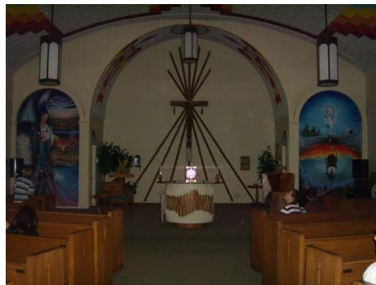
St. Stephen's Mission Church at Arapahoe, Wyoming, is a Jesuit Roman Catholic Church. The Native American symbolism illustrates the Catholic Faith.