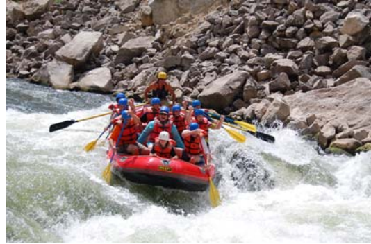
Holy Family Youth Camp 2008 - white water raft trip in the Wind River Canyon of Wyoming.

camping, touring St. Stephen's, working on crafts, attending Mass at Church of the Morning Star on the Wind River Reservation, and much, much more.