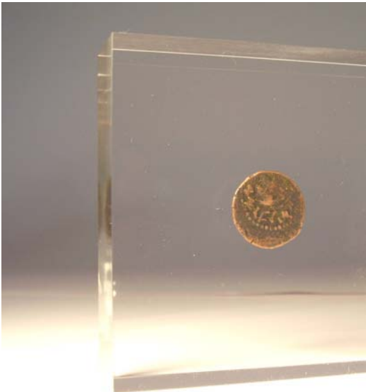
Test product. The finished item will include a prayer on one side, the coin on the other.

Note – New Provincial Website www.holycatholicanglican.org